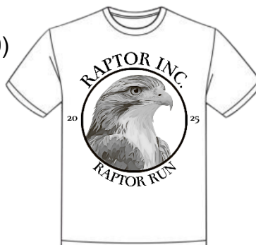
Front (Tshirt color pending)